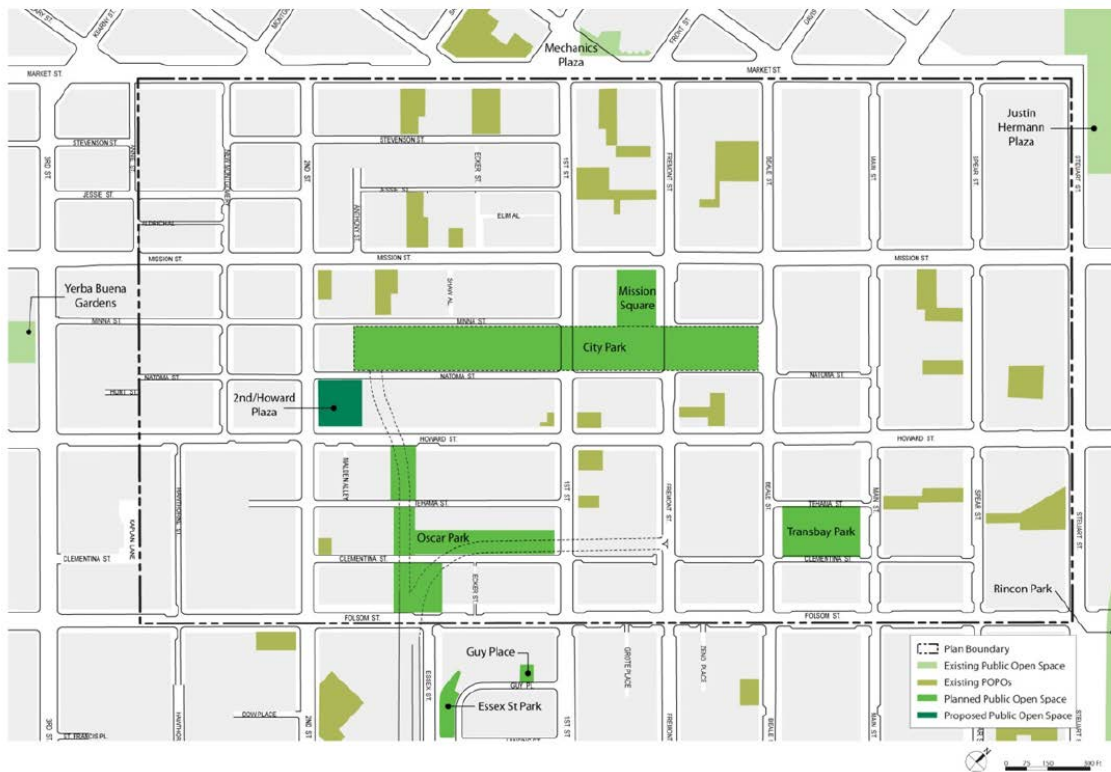
Figure 1. Map of Transit Center District Plan Area and proposed City Park. A digital map is available via the San Francisco General Plan website: http://www.sf-planning.org/ftp/general_plan/Transit_Center_District_Sub_Area_Plan.pdf

http://www.sfbos.org/ftp/uploadedfiles/bdsupvrs/resolutions15/r0418-15.pdf