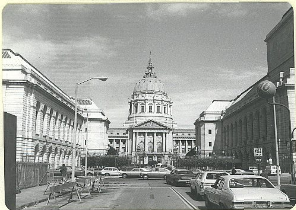
CITY HALL 2.TIF