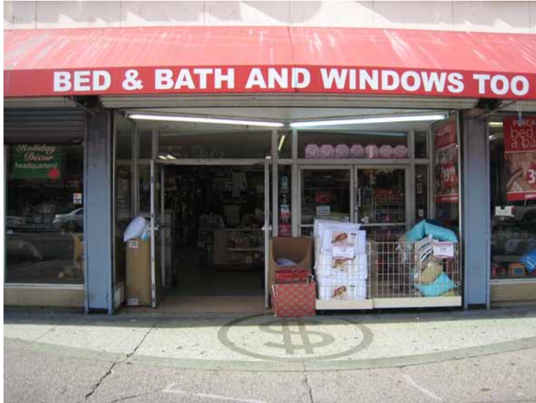
Detail of vestibule.