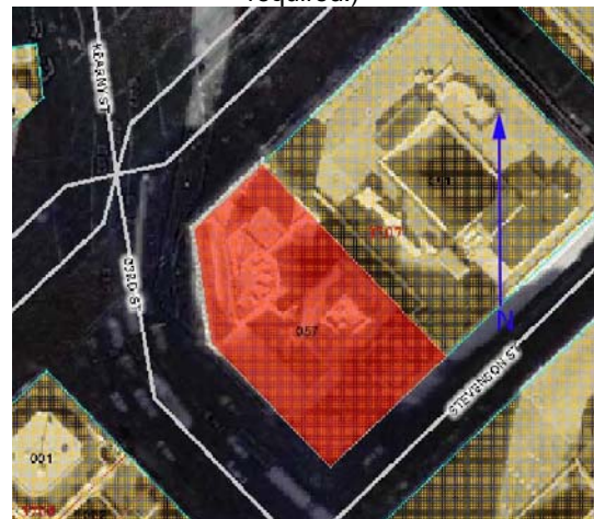
(Sketch Map with north arrow required.)

(This space reserved for official comments.)