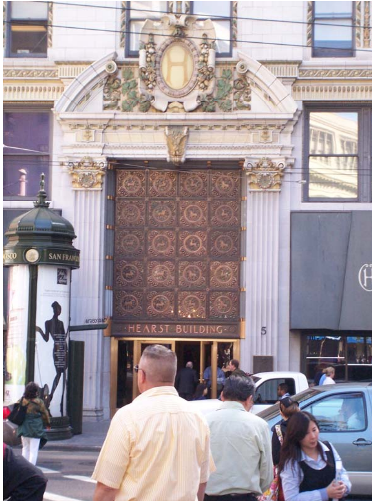
Main Entrance, 100_4459, 9.26.07